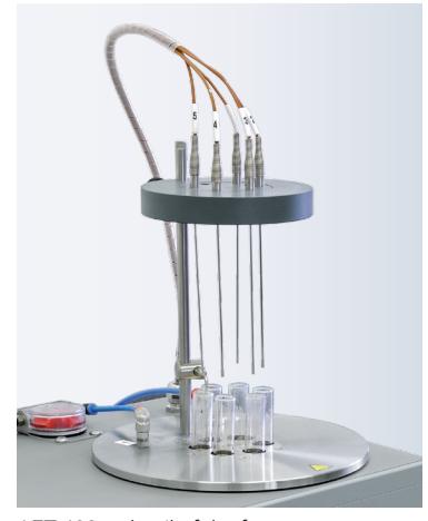
AET 402 – detail of the furnace